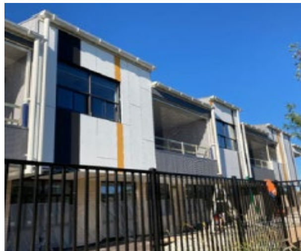
Franklin school expansion