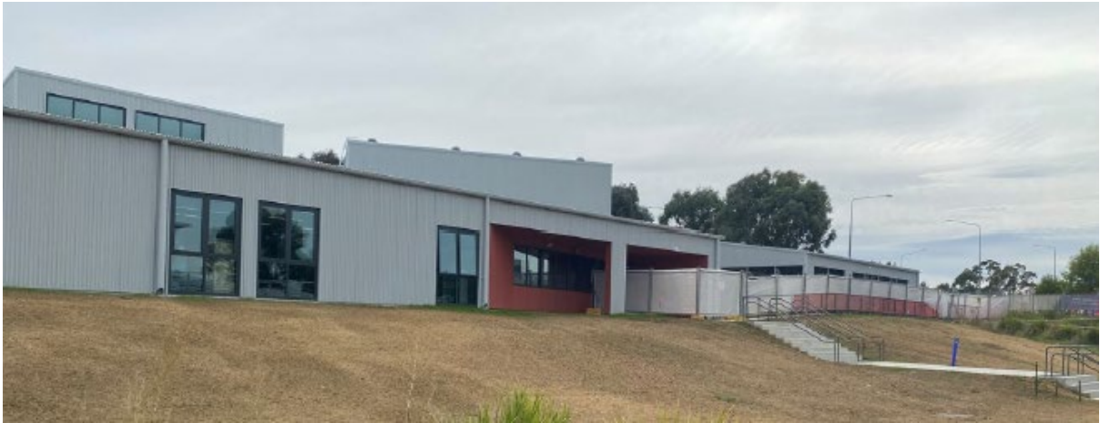
Amaroo school expansion