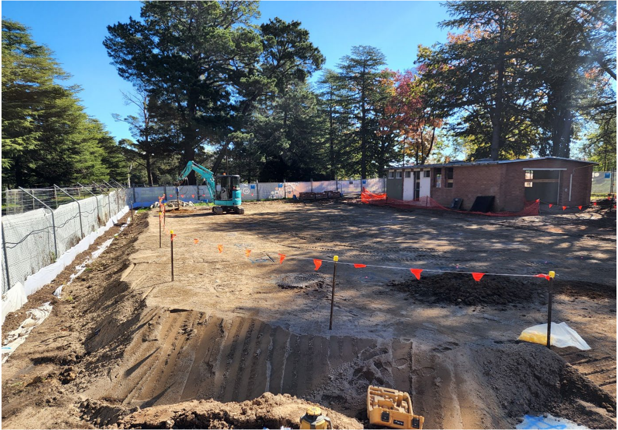
Haig Park Community centre