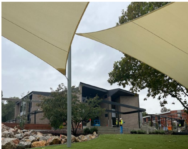
Campbell primary school modernization