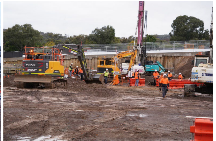
Canberra Hospital Expansion – Construction site images