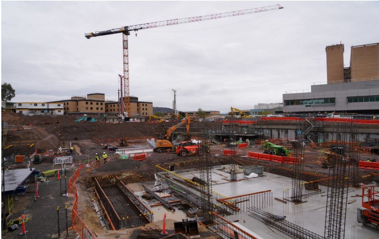
Canberra Hospital Expansion – Construction site images