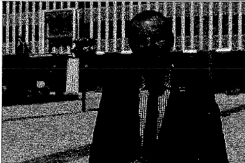
Photo: ACT Chief Minister Andrew Barr records a video endorsement for Dexar Group.

Video: ACT Chief Minister Andrew Barr's endorsement of Dexar Group (ABC News)