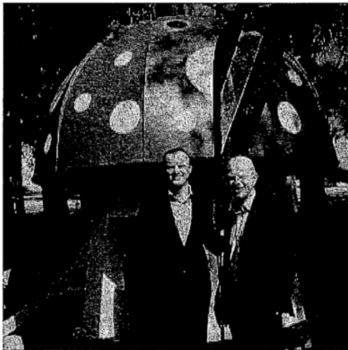
Photo: ACT Chief Minister Andrew Barr said it was his job to support Canberra businesses.

Mr Barr released a statement defending the endorsement, saying it was his job to "support Canberra businesses to grow and expand".