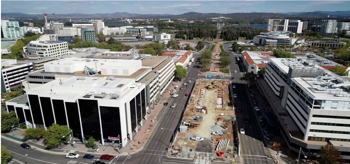
Light Rail – Stage 1–Alinga Street median construction works looking south