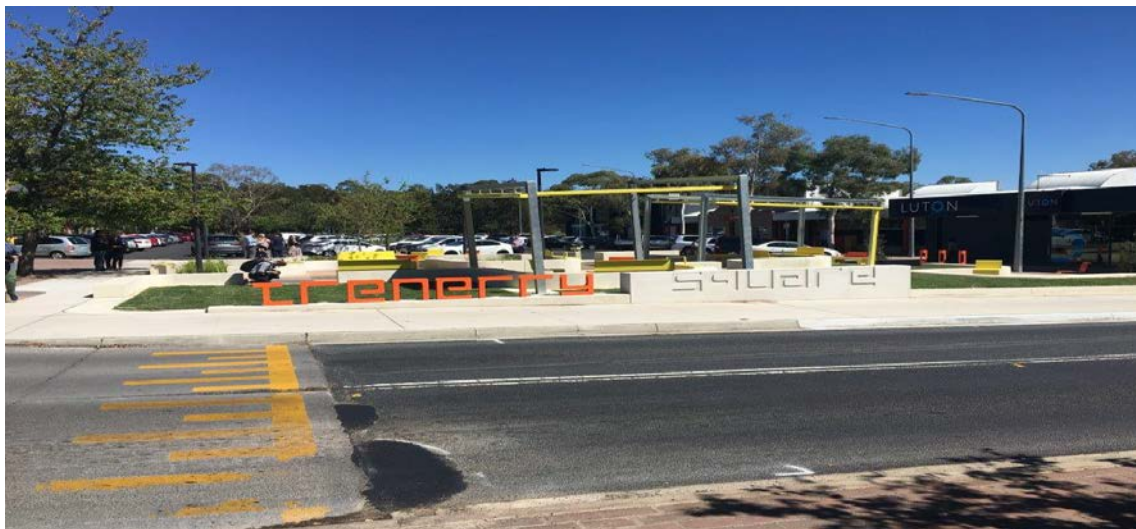
Weston Trenerry Square