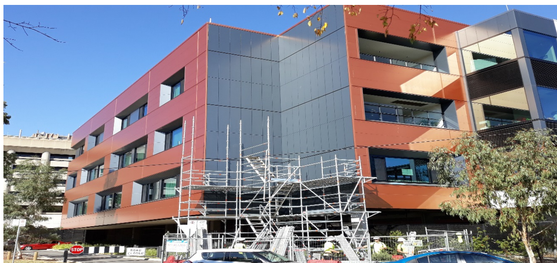
Centenary Hospital for Women and Children - Composite panel replacement