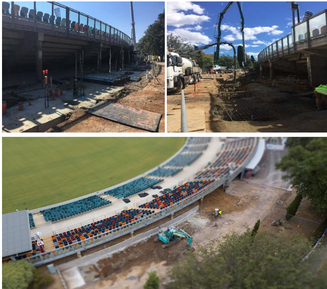
Manuka Oval Improvements