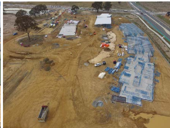
North Gungahlin school infrastructure