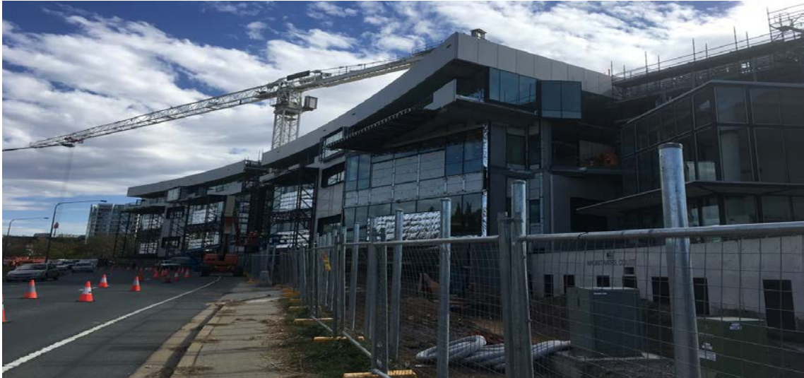
ACT Law Courts Facilities