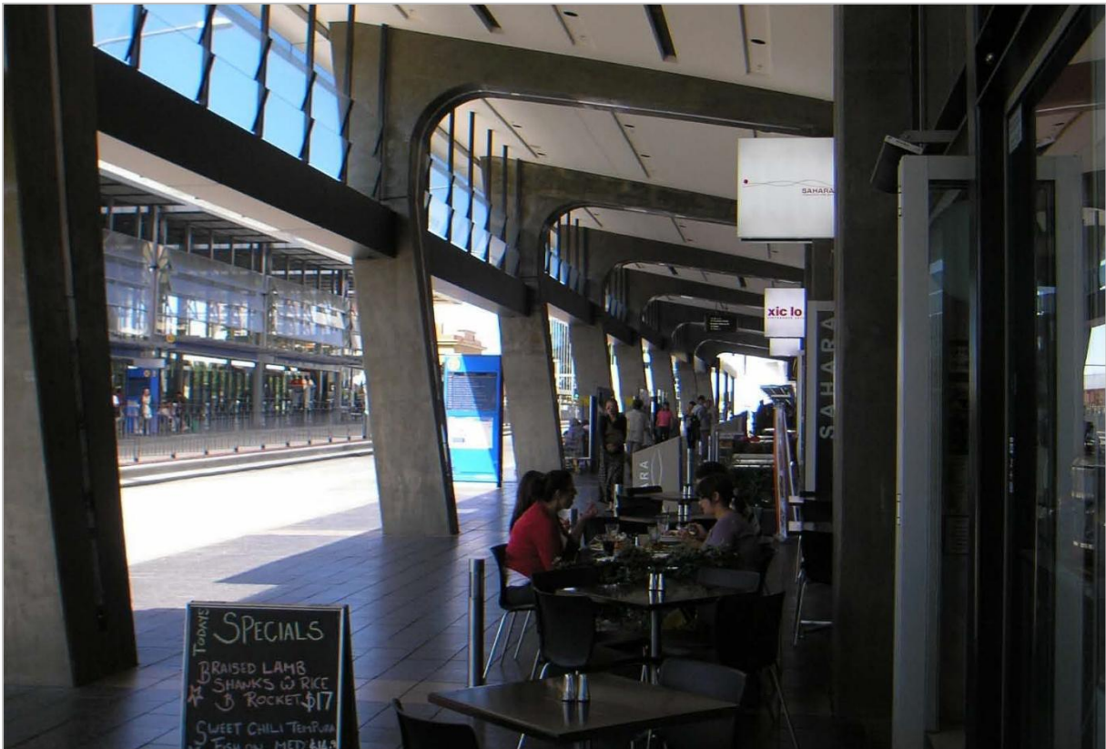
Figure 2: Retail colonnade at Parramatta Bus Station