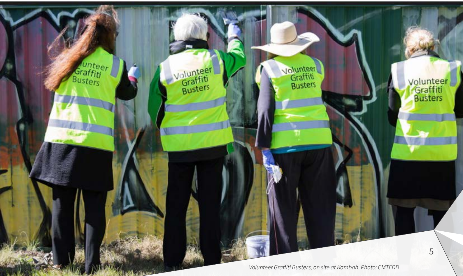
Volunteer Graffiti Busters, on site at Kambah.