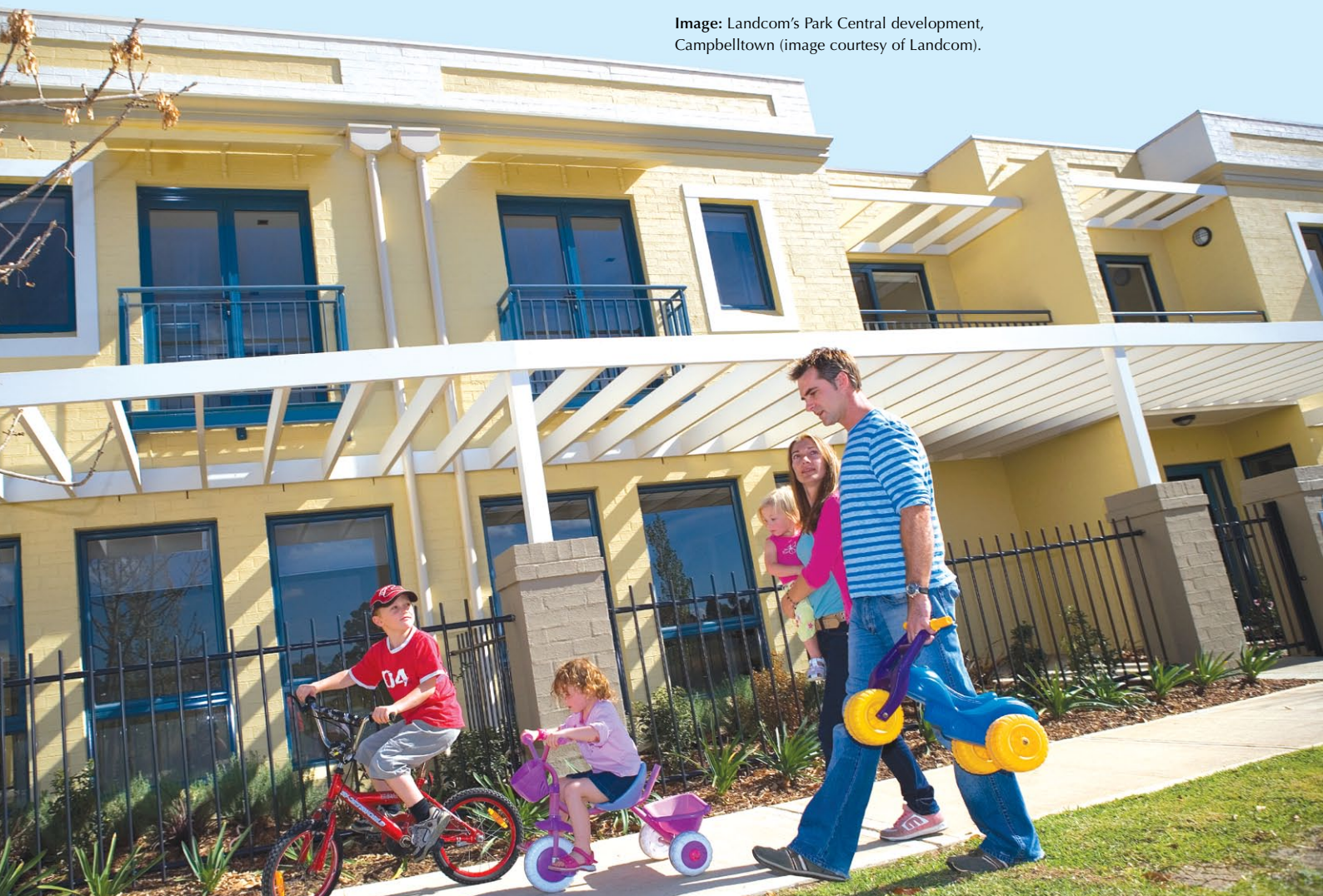
Image: Landcom's Park Central development, Campbelltown.

Together we play a role in building healthier communities and reducing the impact of cardiovascular disease on Australian families. This brochure highlights the results of our survey and provides some basic guidance on how new developments can appeal to the market demand for healthy neighbourhoods.