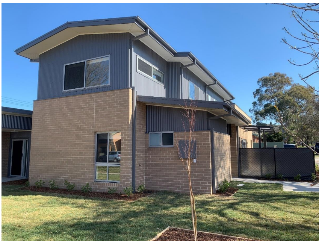
Public Housing Renewal