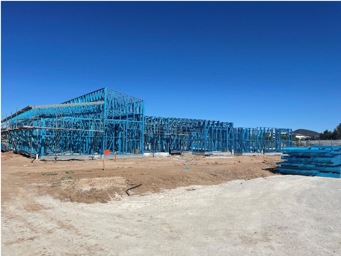
Eating Disorder Treatment Centre