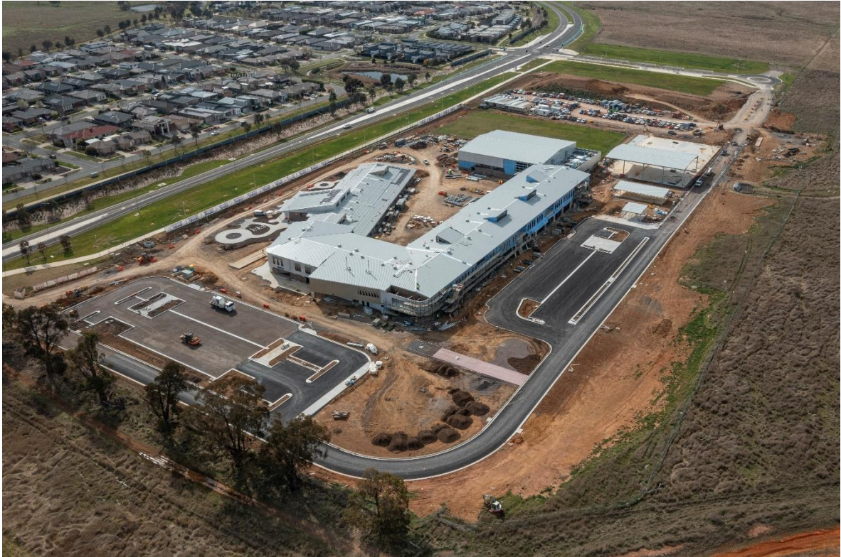
Shirley Smith High School

The Capital Works Program also includes investment in Information and Communication Technology (ICT) and Plant and Equipment (P&E).