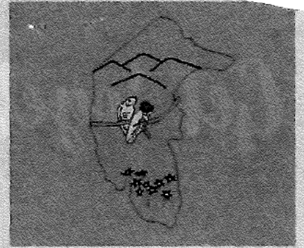
An alternate design for the ACT's coat of arms.

Native symbols such as the gang-gang cockatoo, wattles and royal bluebells were all suggested for inclusion on the new coat of arms.