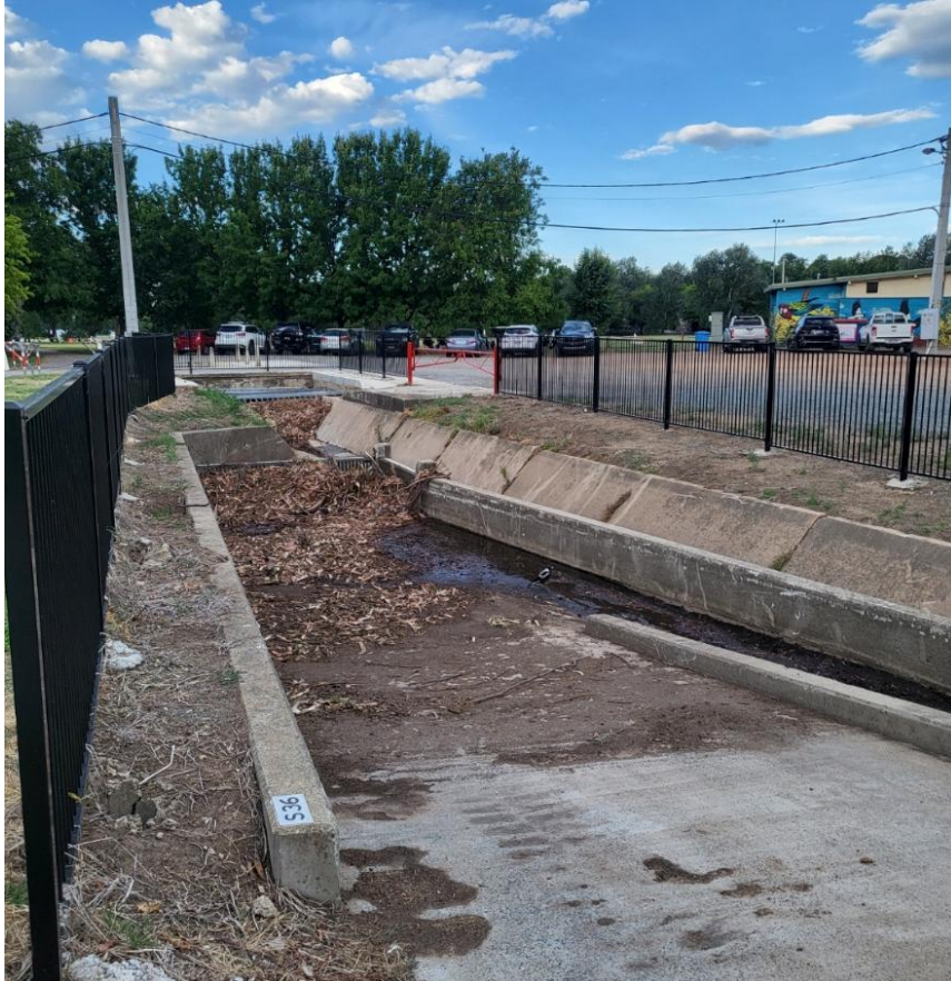
GPT 27 January 2025