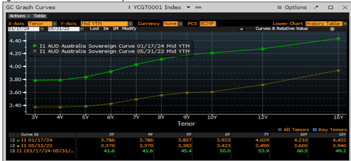
Figure 2: Commonwealth Yield Curve Comparison

Figure 2 shows the Commonwealth yield curve, or their estimated borrowing costs for different maturity terms, on 17 January 2024 compared with their estimated borrowing costs at end May 2023, with an increase of +0.6% in their estimated 10-year borrowing cost over that period.