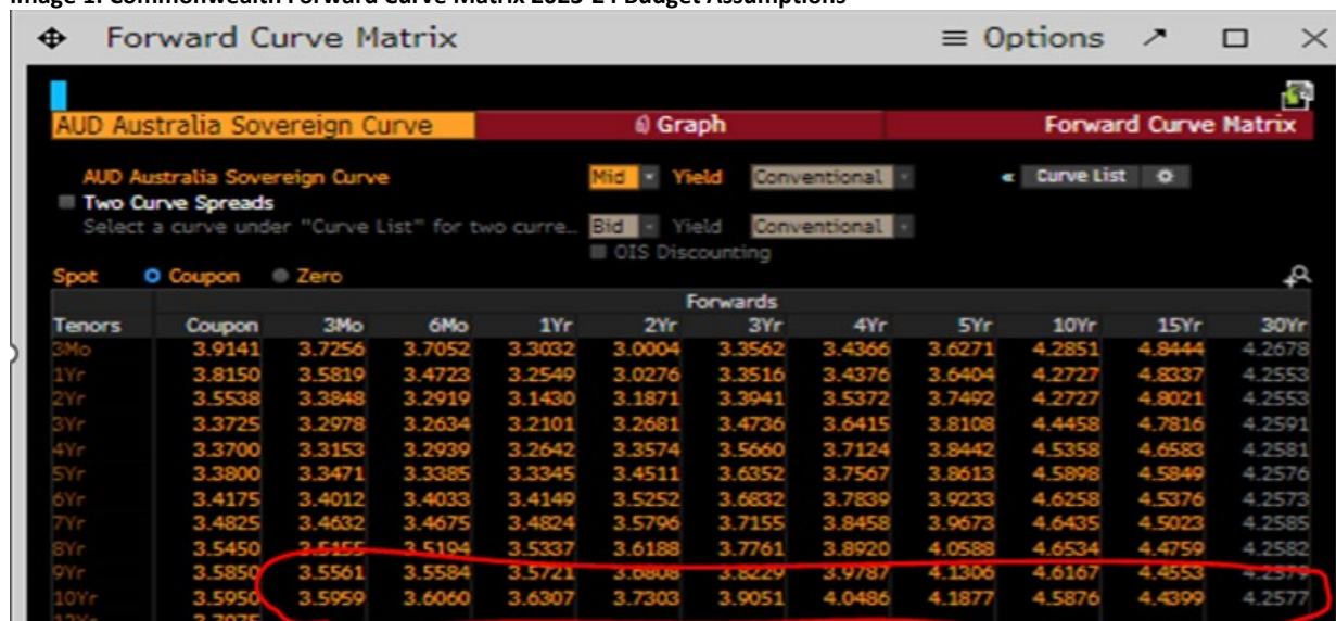
Image 1: Commonwealth Forward Curve Matrix 2023-24 Budget Assumptions

Image 1 below is the Commonwealth Forward Curve Matrix and shows the implied 10-year forward rates used for determining the 2023-24 Budget Assumptions.