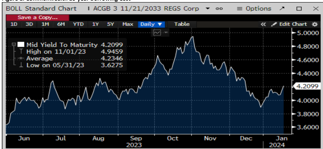
Figure 1: Commonwealth 10-year Borrowing Cost

There has been ongoing volatility in domestic interest rates over the 2023 calendar year due to uncertainty in relation to the outlook for both economic growth and inflation, as well as increasing geo-political risks. The volatility in domestic interest rates is demonstrated by the variability in the estimated Commonwealth 10-year borrowing cost over the period from end May 2023 to mid-January 2024 reflected in Figure 1.