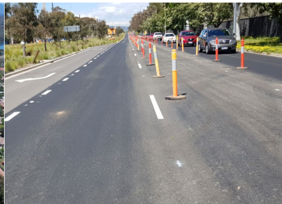
Northbourne Avenue Pavement Rehabilitation