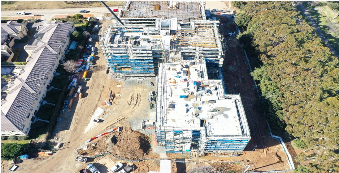
Common Ground Dickson