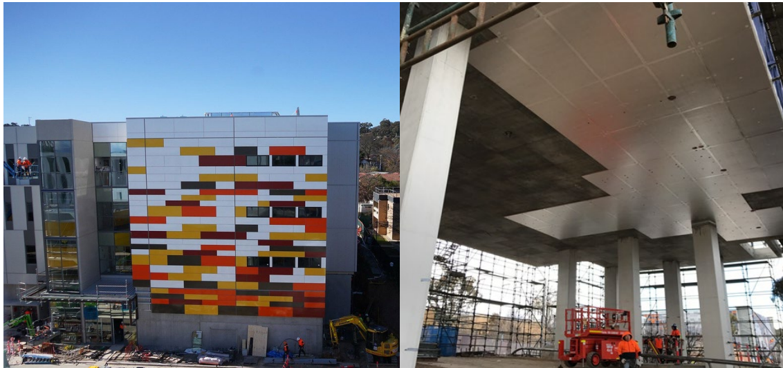
Canberra Hospital Expansion project – Building 8 Canberra Hospital ICU Expansion