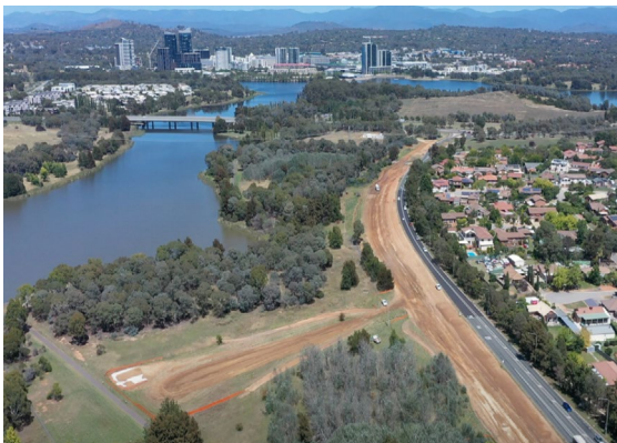
Gundaroo Drive Stage 3