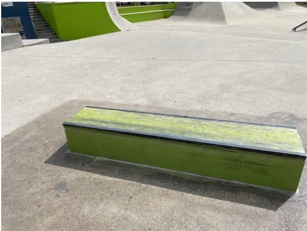
Image 5: An example of a small skate park feature at Tuggeranong Skate Park that was added unofficially by skate park users.

7.11. During its visits to ACT skate parks, the committee saw a number of smaller skate park features at various parks that were not part of the original builds but had been added later by skate park users. An example is provided at Image 5.