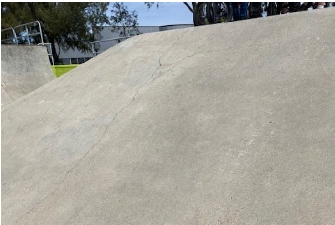
Image 2: Cracked skate ramp surface, Tuggeranong Skate Park.