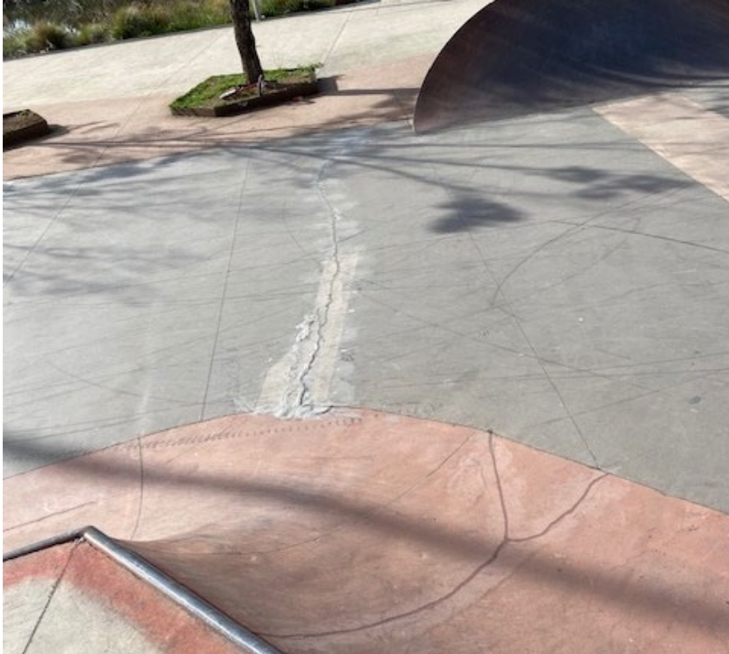
Image 3: Repair of a crack at Belconnen Skate Park.