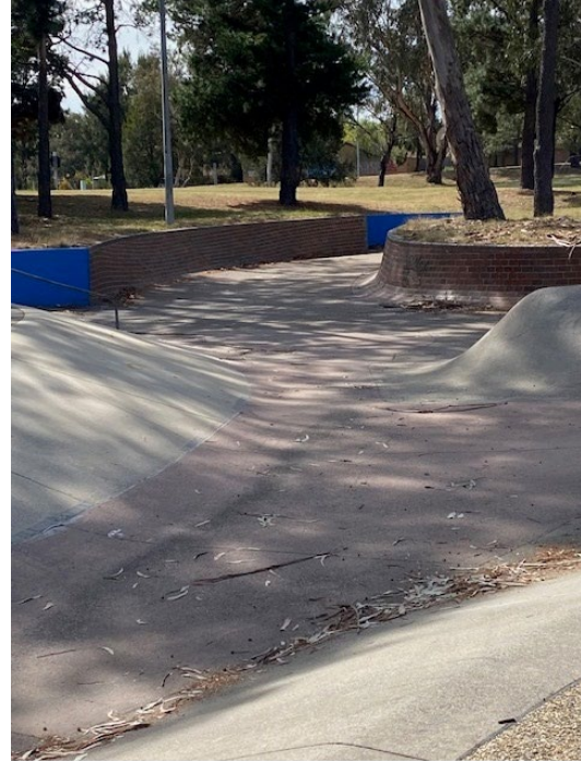
Image 7: Erindale Brick Banks.