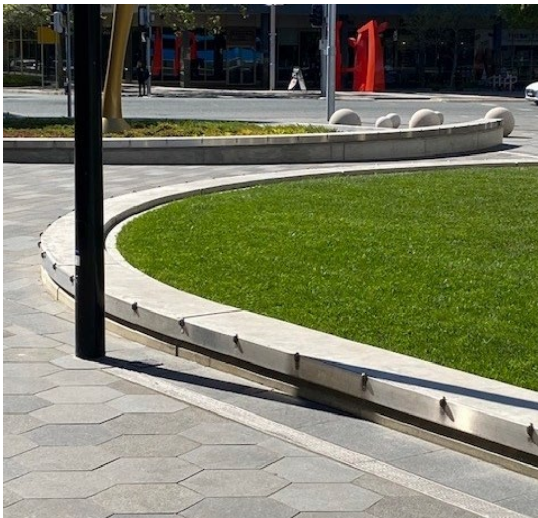
Image 1: Skate-stoppers on a ledge near the ACT Legislative Assembly.