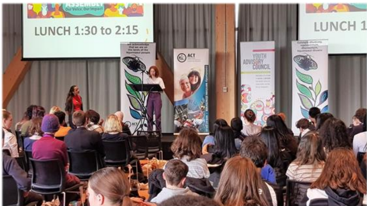
Youth Employment Forum recommendation feedback session.