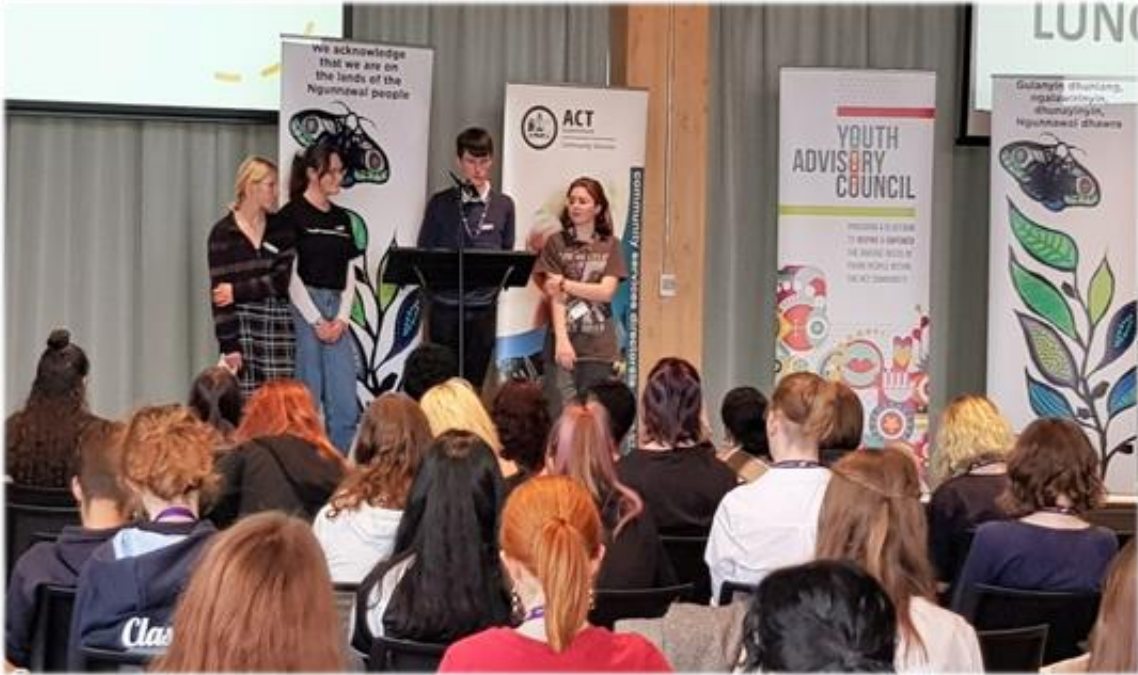
Environment and Sustainability Forum recommendation feedback session.