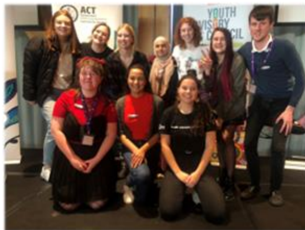
ACT Youth Advisory Council members

Council members also participate in other committees, working parties, taskforces, and other ACT Government agencies.