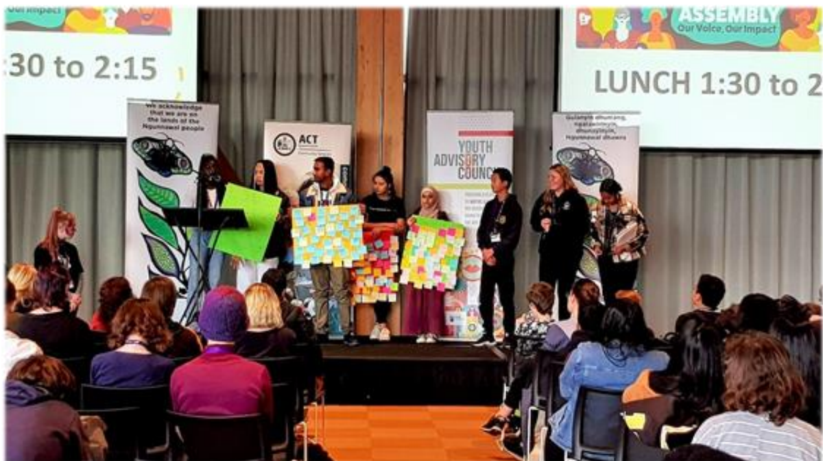
Inclusive Society recommendation feedback session.