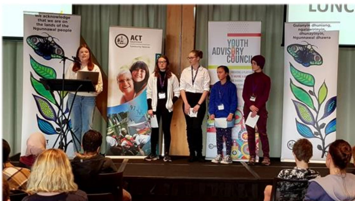
Resilience, Rights and Respectful Relationships Forum recommendation feedback session.

Reference: Family Planning Alliance Australia. (2016) Relationships and Sexuality Education in Schools Position Statement. Retrieved on 11/07/21 from https://www.familyplanningallianceaustralia.org.au/wp-content/uploads/2017/04/FPAASchools-Education-Position-Statement-001-v2c.pdf