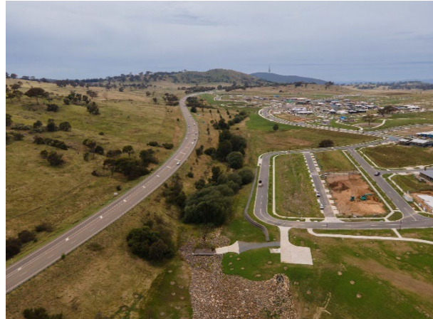
Figure 4: William Hovell Drive Duplication