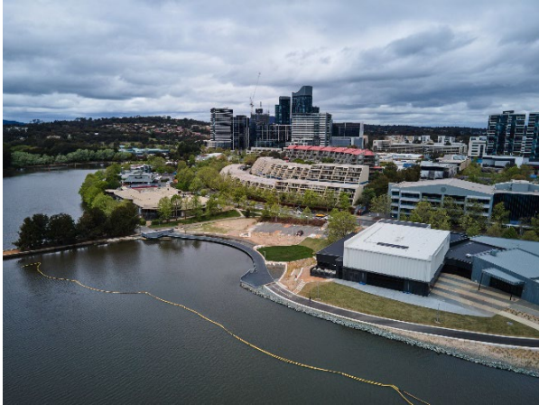
Figure 3: Lake Ginninderra improvements