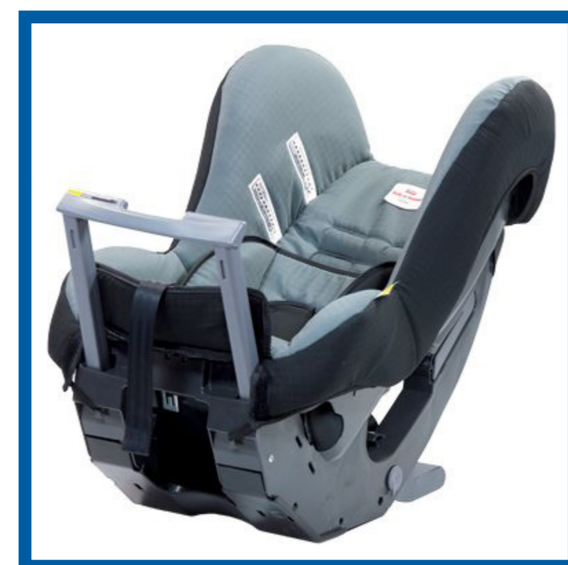
0 - 4 Convertible Child Restraint (0 - 4yrs approx.)