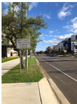
21 Sep 21

I access Northbourne daily to get out of my suburb and most often use the Barton Highway due to traffic, therefore was not familiar with nor looking for new signs. I had not used Northbourne for some time. I definitely would have avoided it, had I known they had changed the limit. It's not practicable to commute from [REDACTED] every day for a 25-minute run at that speed. The last time I used the road it was night; I did not see any 40 km signs and one lane was blocked off - therefore impossible to do over 40 km due to congestion.