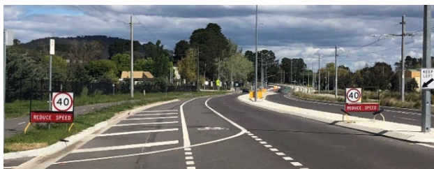
Epic with corresponding reduce speed signs and 40 number is larger, Message is clear and visible.

Other 40km zone signs spotted in Canberra have larger signs and are placed lower, clearly visible at a distance as lower down.