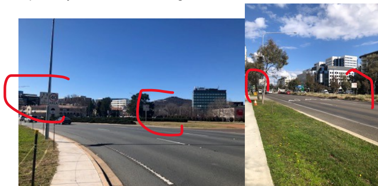
South end entry

especially when transitioning from 70 km on Adelaide Ave as below