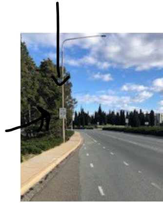
South End- End of zone marked black sign

Until recently when the North end signs were moved, both ends cameras were placed 500 m from the beginning of the zone with no warning of approaching it or reduce speed signs as in other areas. This is of particular importance when transitioning from the South northbound (Adelaide Ave) from 70 km to 40 km. There is insufficient signage to prompt motorists to slow down in time