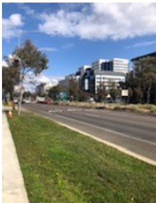
Taken where 60 km sign used to be August 9

This meant by the time you slowed down to 40km the sign was just after, and the camera got you as it was only 200m from the 40 km signs. The 40 km signs were not previously next to the paint on the road. This whole area has changed both the 40 km signs and the 60 km signs have been moved further.