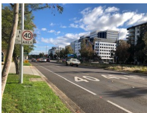
Clearer with no tree in front?

This theme but with larger signs needs to be repeated at each road marking, there is no pattern or consistency to the signs on Northbourne.