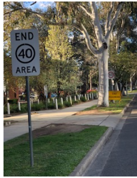
Pic 1 and 2 North End- End of zone Sep 26 21