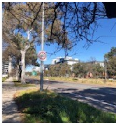
Taken 21 September