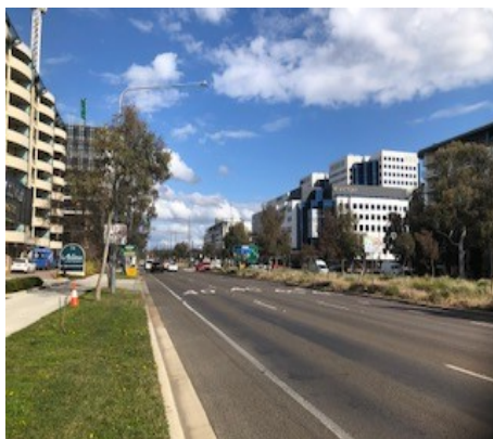
9 th August 21

A new speed camera sign went up after all the publicity began: