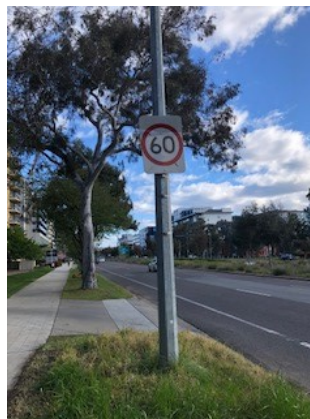
New position 800 m from 40 zone on pole

The 40 km signs were moved to the paint on the road to correspond with the road markings (also after my email) the 60km signs been moved to around 800 m back now and put on a pole. After this was done, I received a letter from Access Canberra the saying the signs were adequate.