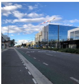
New paint near tram stop no signs to keep them consistent as below

Until recently I only saw one painted area on the road- Southbound near Barry Drive. This has also increased since the publicity I have now observed one near the tram stop. It was not there before. It appears the new one was painted after my fine and before my letter from Access Canberra.