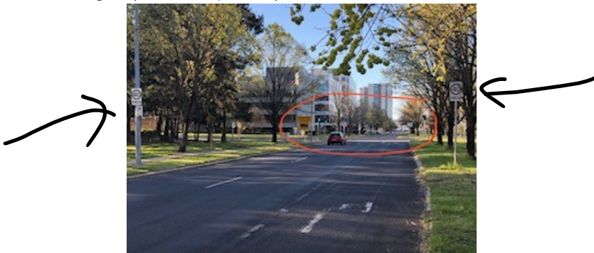
Belconnen near the police station Black "40 Ahead" signs in the forefront, before the actual 40 km zone sign. (Circled in red ). These signs do not exist on Northbourne Ave

There is no notification of the beginning of the 40 km zone either end of Northbourne before the actual zone as in Belconnen pictured below, Black "40 Ahead" signs are placed before the actual 40 km signs (circled in picture)