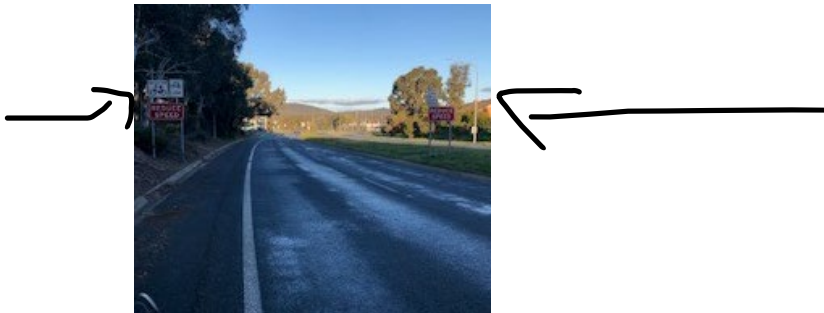
Ginninderra Drive to Lyneham (Yarra Glen is similar)

No reduce speed signs as on Ginninderra Drive as in below picture where you are notified well before the speed changes from 80km-60km. More warning given for a 60km zone than a 40 km busy road with a tram?