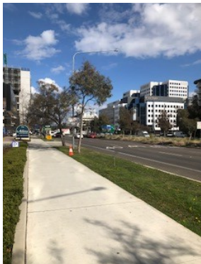
Can't see 40 signs

The signs were also obscured by trees or moved as below.