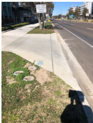
Old position of 60 km signs 200 m from 40 zone (holes)

I have the photo of the hole filled where the 60 km signs were when I was fined.